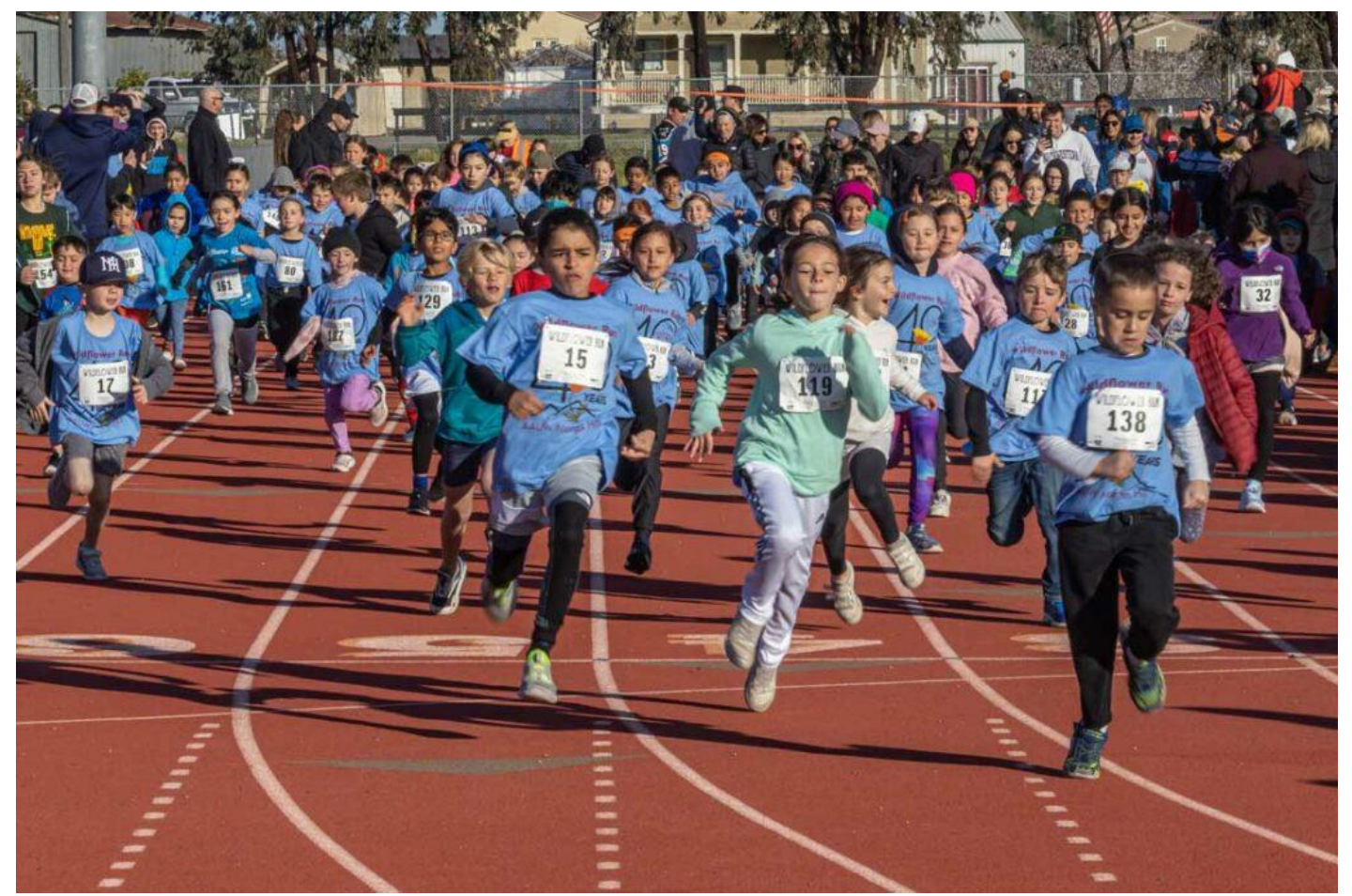
Young participants take off from the starting line of the Kids 2K run at the March 26 Wildflower Run at Live Oak High School.

In the last 10 years alone, the Wildflower Run has raised more than $500,000 for causes and programs promoted by AAUW.